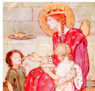
St. Margaret of Scotland

Tassone, 'Praying with the Saints for Holy Souls in Purgatory' and 'Prayers, Promises and Devotions for the Holy Souls in Purgatory', are useful reading. In the latter there are prayers of comfort, encouragement, commitment, and consolation. Some will be familiar to an older generation but are useful as a teaching tool for younger members of the church. They also include prayers for the dying which bring much solace.